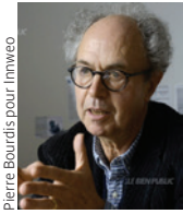
Pierre Bourdès pour Inweco