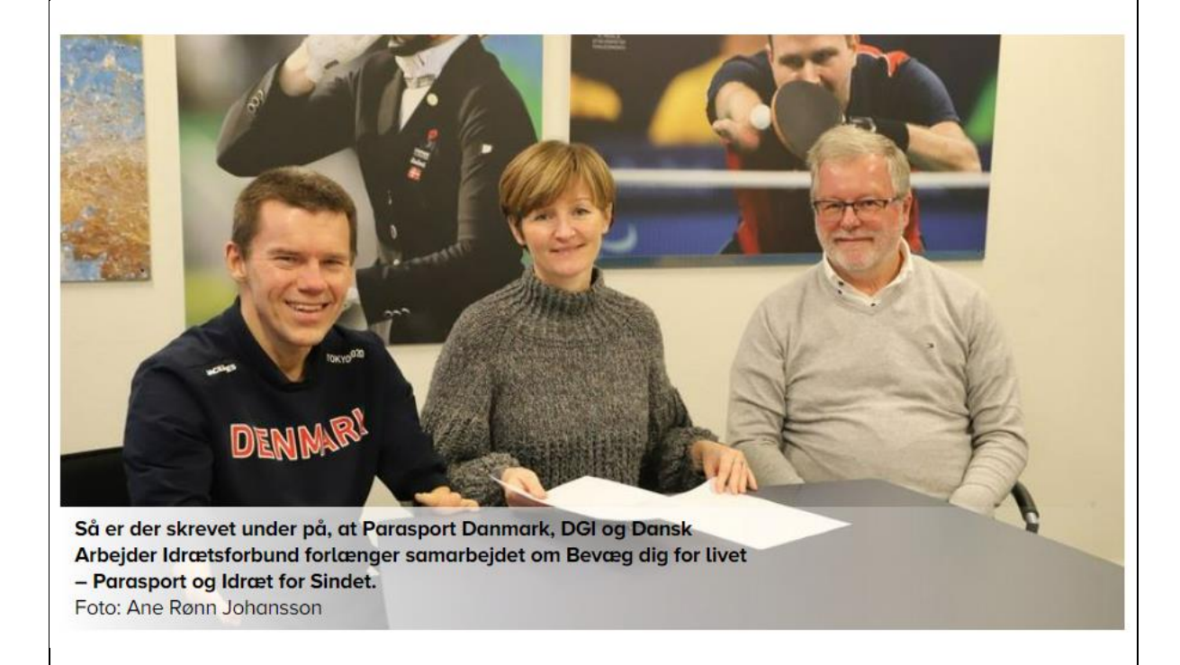
Image from the signing of the continuation of the umbrella initiative3

The municipal initiatives are always cross-cutting. For instance, one municipality-initiated collaboration between local sport clubs, the local school, and municipal care institutions.