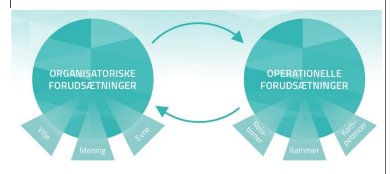
Model udarbejdet på baggrund af kilder: Pilgaard & Kjær, 2018, Petersen & Ibsen, 2009.

Concretely, the evaluator comes up with three proposals for a future structure: A municipal cooperation model, a national platform model and a social economic cooperation model. What they have in common is that a number of organizational and operational prerequisites must be in place, as illustrated below.